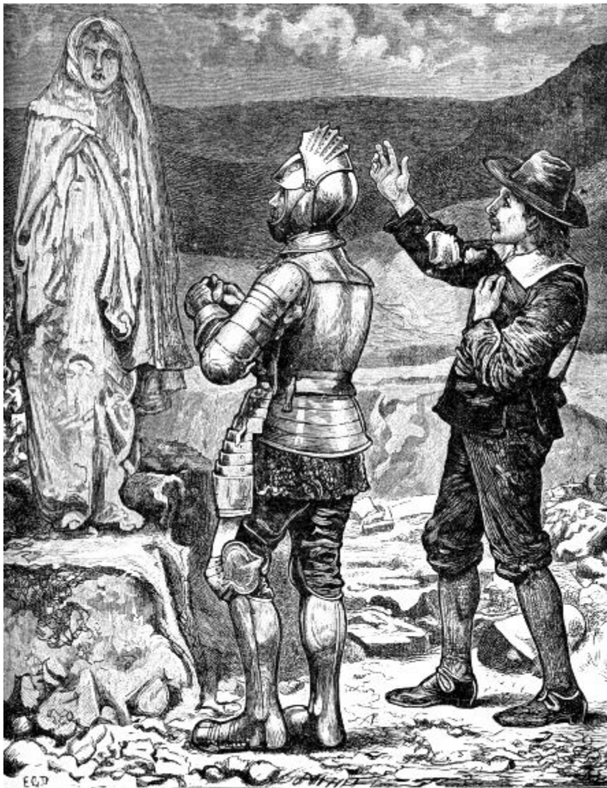
"They stood looking and looking upon it, but could not tell what they should make thereof."